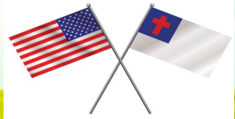
Our "Pride" Flags!